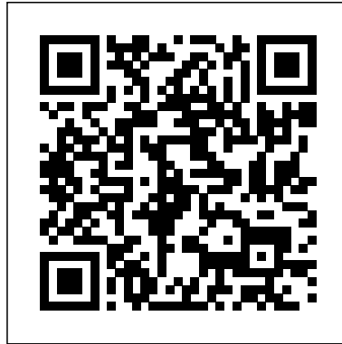
Table Insert | JBTS10MJS-218