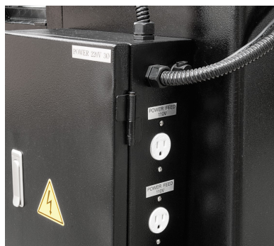
ELITE MILLS FEATURE TWO CONVENIENT PLUG-INS FOR POWERED ACCESSORIES