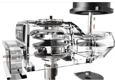
PATENTED VARI-DISC KEY PROVIDES UP TO 10 TIMES THE WEAR RESISTANCE THAN ALUMINUM OR BRASS KEYS