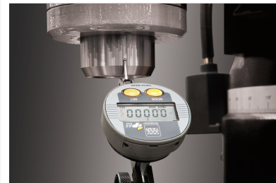
INDUSTRY LEADING SPINDLE TAPER RUNOUT OF 0.00012" ENSURES STRICT TOLERANCES