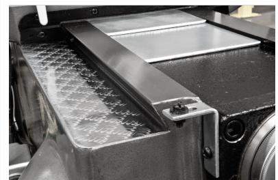
HAND SCRAPED WAYS FOR GREATER OIL RETENTION AND SMOOTH MOVEMENTS