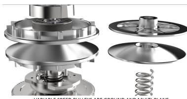
VARIABLE SPEED PULLEYS ARE GROUND AND MULTI-PLANE DYNAMICALLY BALANCED, REDUCING VIBRATION AND ENSURING SMOOTH SPEED TRANSITIONS